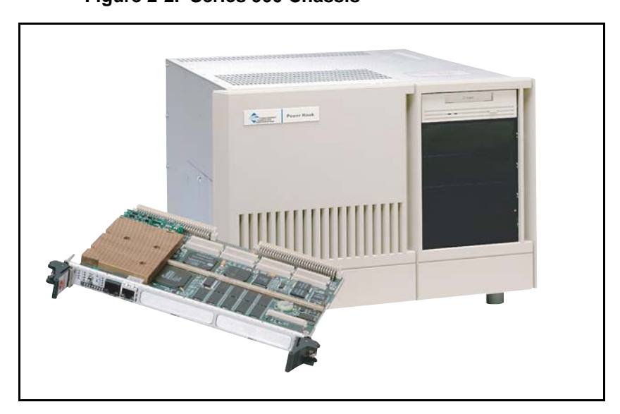
Figure 2-2. Series 900 Chassis

The Power Hawk 900 Series systems are available in rack mount or table-top options. The Series 900 chassis is available in 12-slot or 21-slot 6U VME configurations. The chassis contains integral peripheral bays and auto ranging power supplies. A typical Series 900 chassis with SBCs also shown, is illustrated below.