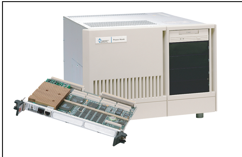
Figure 2-2. Series 900 Chassis

The Power Hawk 900 Series systems are available in rack mount or table-top options. The Series 900 chassis is available in 12-slot or 21-slot 6U VME configurations. The chassis contains integral peripheral bays and autoranging power supplies. A typical Series 900 chassis with SBCs also shown, is illustrated below.